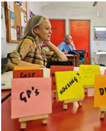
The community research café in session.

We are guided by a simple belief: those who live it know it best and they should lead change in their own communities.