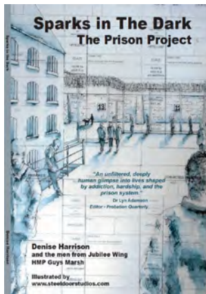
The cover of Sparks in the Dark .

We've decided to call it "Sparks in The Dark", because this book is living proof that good things can come out