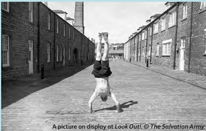
A picture on display at Look Out! .

Photo gallery: A photography group of residents at The Salvation Army's Strathmore Lodge Lifehouse in Dundee held an exhibition in October, showcasing the incredible work participants in the group produced. The group was given cameras in 2024 and tasked with capturing the city from their own perspective. In October 2025 the results, featuring mostly film and some digital photography, were put on display at Dundee Central Library. The exhibition, Look Out! , was open for two weeks from 9 October, with free entry for visitors. Ricky, a resident of Strathmore Lodge and member of the photography group, stressed the enjoyment of the project in a press release: "My favourite thing was going out on photo walks. Enjoying the sunshine and ending up with good memories that we could print."